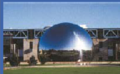
Cité des sciences et de l'industrie La Villette, Paris